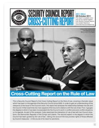
Above: Cross-Cutting Report on the Rule of Law

Overall, the report found that the Council had embraced the notion that establishing and improving the rule of law in conflict and post-conflict situations is an integral part of the mandates it had authorised. Nevertheless, the Council had refrained from addressing rule of law issues in certain country-specific situations despite their likely relevance and had sometimes been inconsistent in its approach. With regard to the rule of law and sanctions, the report found that due to legal and political pressures the Council was in the process of expanding the scope of due process rights it affords individuals and entities affected by sanctions.